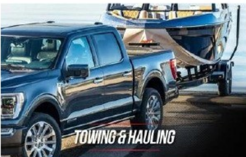
TOWING & HAULING