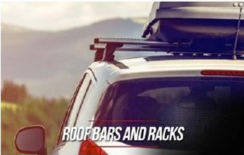
ROOF BARS AND RACKS