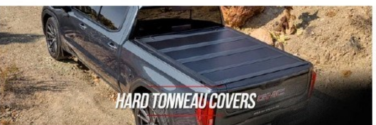
HARD TONNEAU COVERS