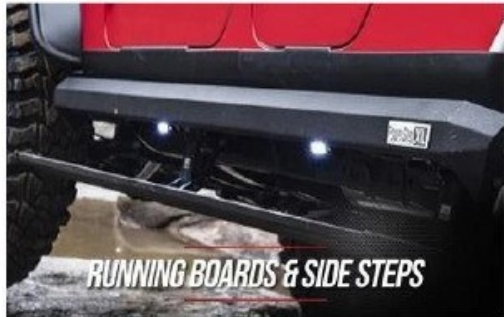
RUNNING BOARDS & SIDE STEPS