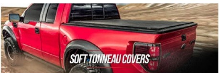
SOFT TONNEAU COVERS